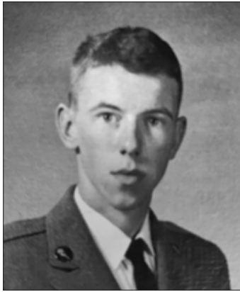
Two year cadet. Private