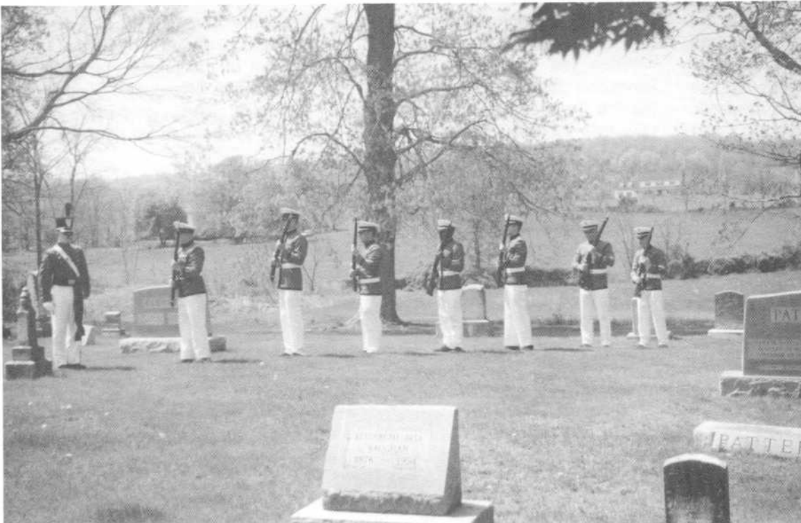
The Fishburne Military School Firing Squad fires a 21-gun salute to the Roller family.

roll of all Augusta men who had passed away in the last year.