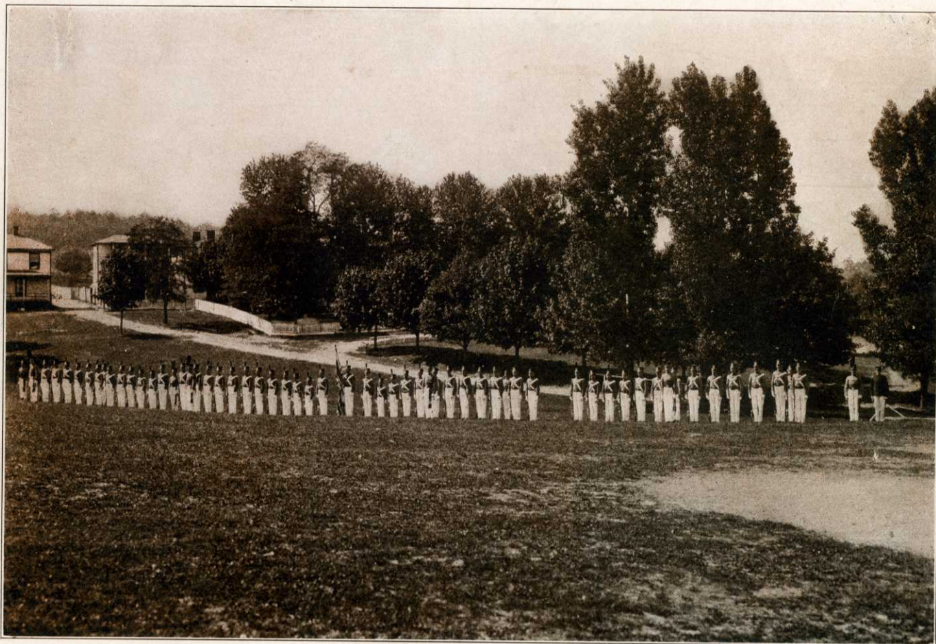
BATTALION ON PARADE